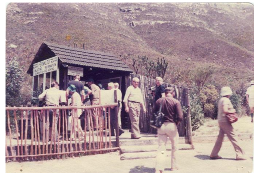
Visitors Centre 1972

A little more than a decade later, including the show proceeds from a flourishing indigenous plant nursery run by the society, the profits skyrocketed to forty thousand rand, and, into the next century hit the hundred thousand rand mark. Conservation projects benefited from the show proceeds, producing the Fernkloof Tree Trail, Walks on Wheels and the restoration of the Fernkloof botanical gardens, and three years of contribution to a coordinator for the Ecoschools programme.